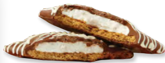
Ooey Goey - Milk Chocolate S'Mores