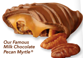
Our Famous Milk Chocolate Pecan Myrtle®