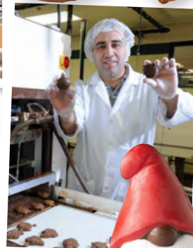
Quality is Job 1