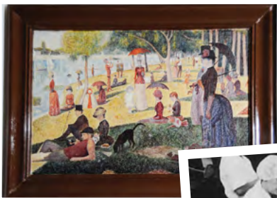
'Painted' with Chocolate